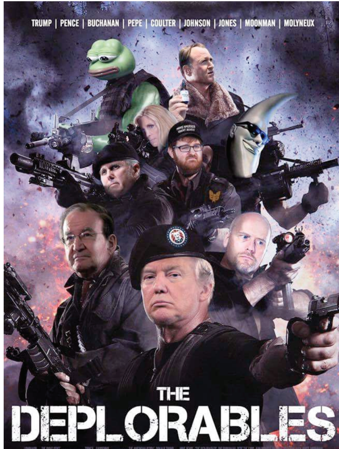
Trump supporters are more likely to be Islamophobic, racist, transphobic, and homophobic.