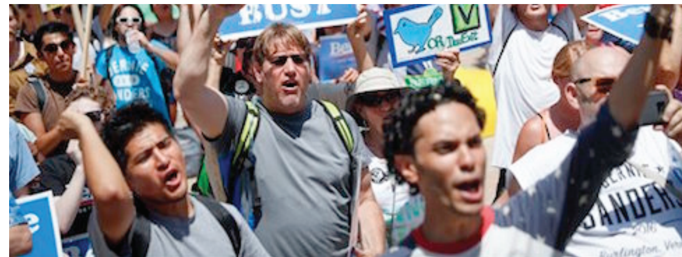
Bernie supporters are financial retards. 84% of millennials are financially illiterate, according to a TIAA Institute report.