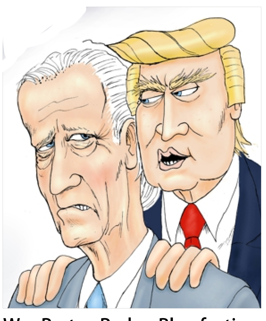
War Party - Red or Blue faction.