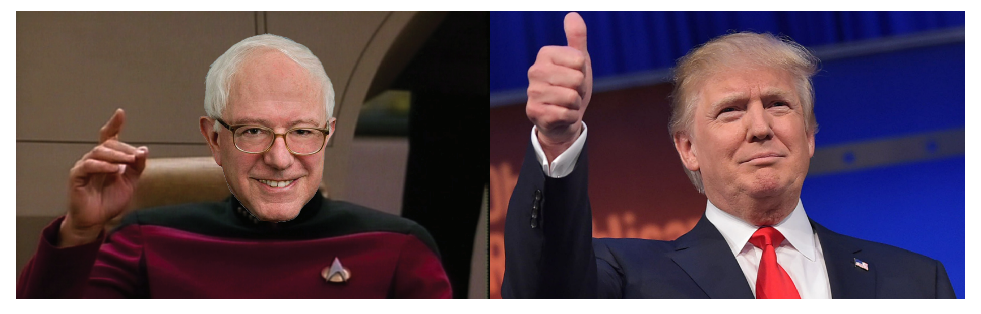
I promise a replicator in every kitchen. And personal spaceships!