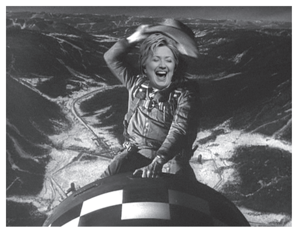
I never met a war I didn't love!

"Democracy is the art and science of running the circus from the monkey cage."