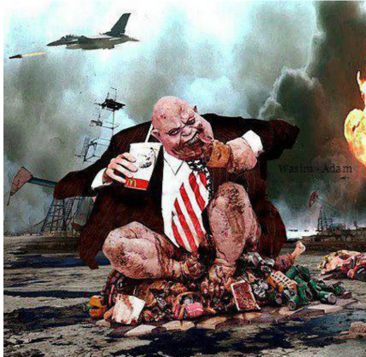
Boogeyman Capitalist Pig