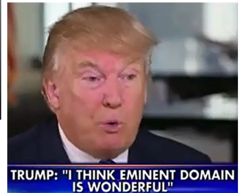
Donald Trump - protectionist