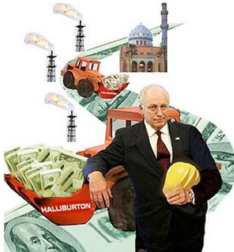
Dick Cheney - war profiteer