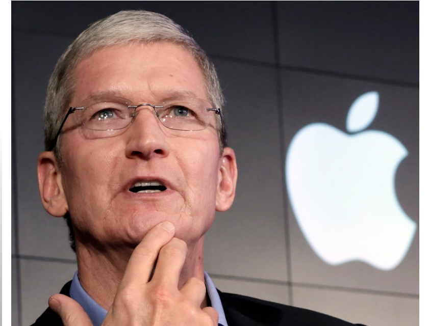
Tim Cook - Apple CEO